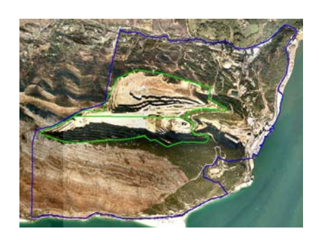
SECIL quarries A (blue) and B (green)

The Parque Natural da Arrábida (PNA) was created in 1976 on account of its ecological, historical and landscape value. The park is dominated by Mediterranean forest, e.g., oak, holm-oak, arbutus-tree, laurel and wild olive. The