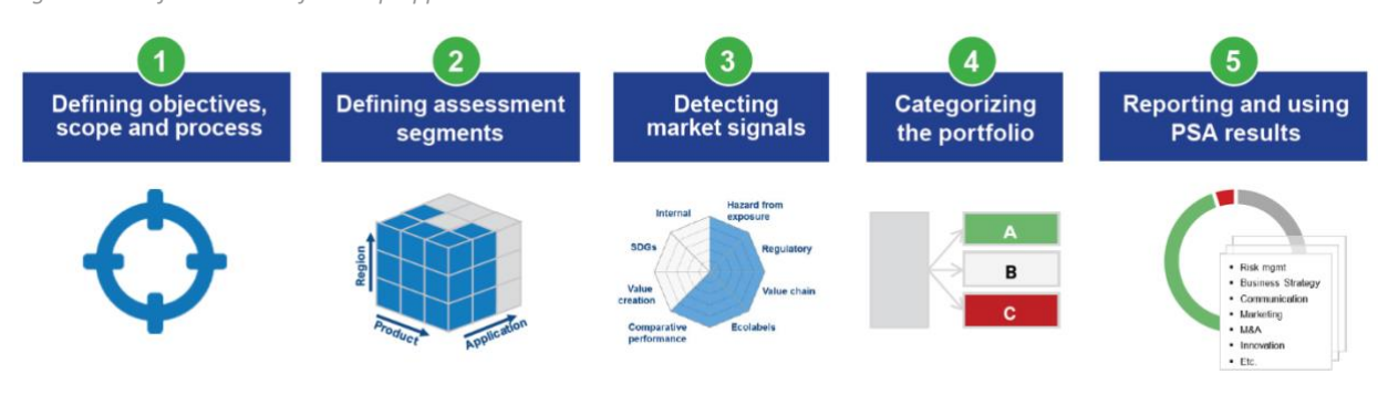
Figure 1: The framework's five-step approach

The PSA framework<sup>4</sup> recommends that companies follow a five-step approach to conduct a PSA. The approach, illustrated in Figure 1, is iterative. This means that companies should use the results of a first assessment to define the objectives, scope and process for future assessments.