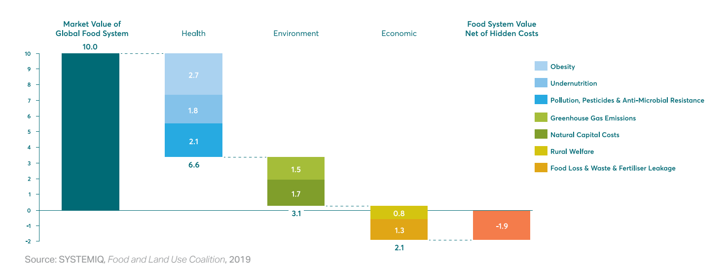
Figure 1: The "hidden costs" of global food and land use systems sum to USD $12 trillion, compared to a market value of the global food system of USD $10 trillion.

The report outlines ten critical transitions to transform the food system. If delivered, we will achieve: