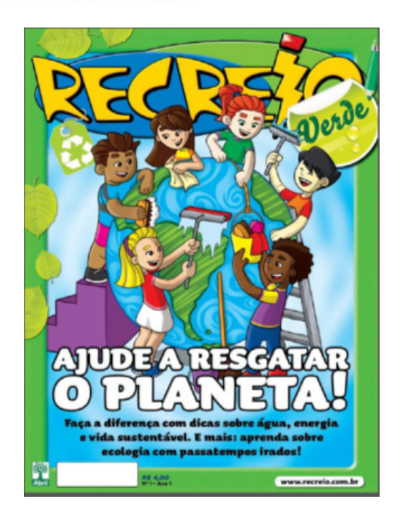
Figure 1: The "Recreio Verde" magazine published in June 2012

"Recreio Verde" contained information on Sonae Sierra Brazil's sustainability journey, including the company's environmental and social responsibility initiatives presented in an easy to understand and engaging way. Through simple language and illustrations, children could learn more about our approach and the progress we have made to date.