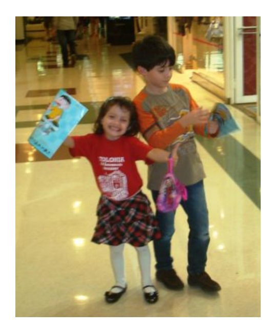
Figure 2: More than 20,000 copies of "Recreio" magazine were distributed to children visiting our shopping centres.

Laureane Cavalcanti Corporate Marketing Manager for Sonae Sierra Brasil