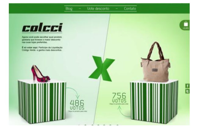
Figure 4: Battle of the Green Code promotional material

We organised a 'Battle of the Green Codes' to raise awareness among shopping centre visitors in the build up to the campaign. Discounts of up to 70% were offered on thousands of selected products in a variety of stores. Shops asked customers to vote for which of two products they wanted a greater discount on. The product with the greatest number votes received the biggest discount. Customers could also sign up to receive an e-mail with a list of the winning products once they were announced.