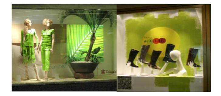
Figure 3: Green window display

In addition to the promotions and sales campaigns, each shopping centre organised smaller individual events such as advertisements through the shopping centre radio station, talks by celebrities and attractive decorations, such as zebracrossings in the parking lot painted with the Code Green logo.