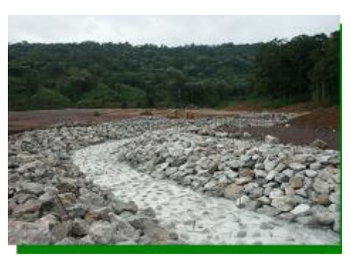
Figure 4: Drainage system in one of the working sites