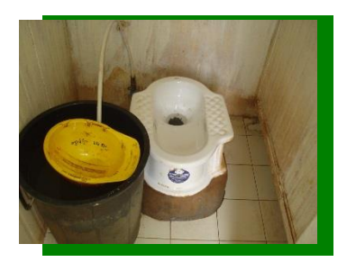
Figure 5: Toilet seats provided in one of the working sites. Designed according to local customs (no toilet seats as these are not used in the region).

Provision of toilets in sufficient numbers<sup>20</sup> and in conformity with international level standards was ensured. Each toilet was indeed: