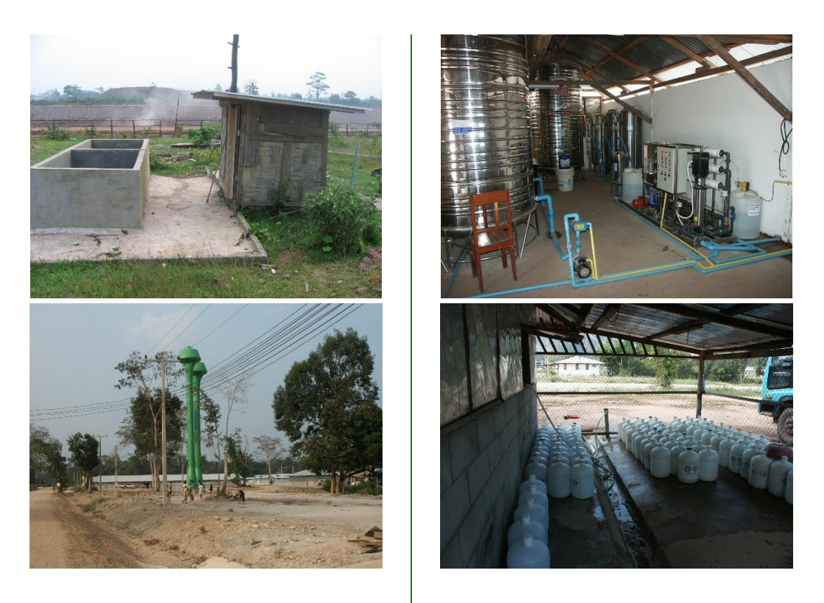
Figure 6: (a) Top left-hand picture: toilet (right) and water container for washing and personal hygiene purposes (right); (b) Top right-hand picture: drinking water treatment plant in the main camp; (c) Bottom left-hand picture: water tower in the main work camp - as a direct drinking water source for the main camp and an indirect one for secondary camps (to which drinking water is transported via trucks and water tanks, see picture d); (d) Bottom right-hand picture: water tanks for transporting drinking water from the main camp to secondary work camps.

Moving beyond the fence - Access to safe Water, Sanitation and Hygiene in surrounding communities<sup>21</sup>