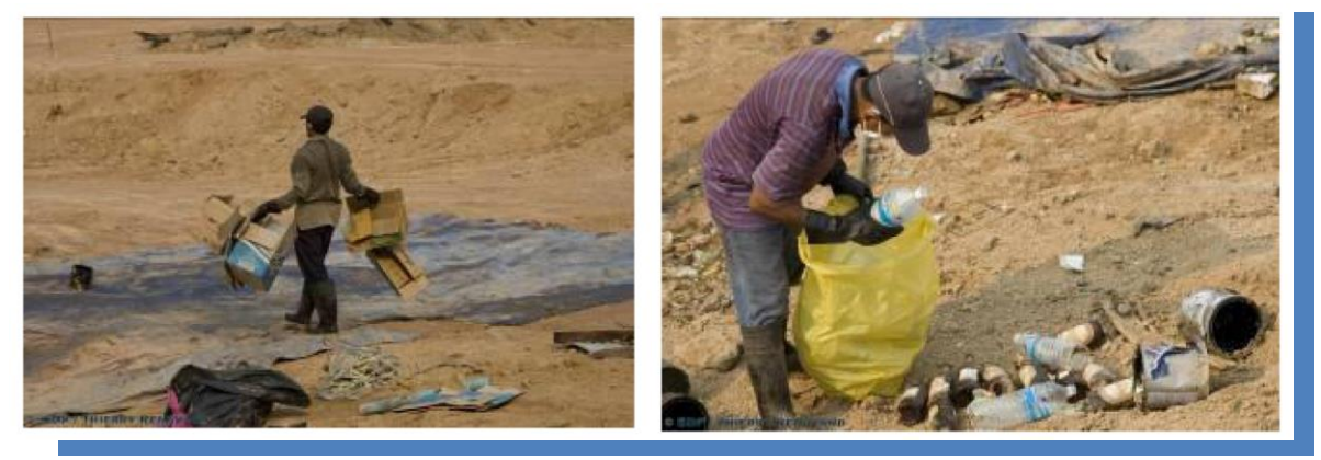
Figure 8: Waste sorting – cartons (left) and plastic bottles (right).

Awareness and training campaigns for the workers regarding waste management were run as well. Waste bins of different colors were installed on the camps to collect separately dangerous, recyclable, and remaining waste. 20 minute long training sessions were organized on a regular basis on the construction sites of the project to explain the rationale and the method of waste sorting and treatment.