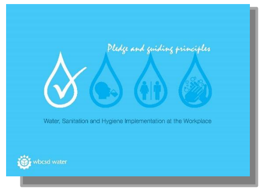
Figure 1: Cover of the Pledge Guiding Principles for Implementation, downloadable freely on the <u>WBCSD</u> <u>website</u>.

EDF, one of the two WBCSD Water Leadership Group Co-Chairs along with Borealis<sup>2</sup>, was among the first companies to sign-up to the initiative, in September 2013<sup>3</sup>. The main argument for doing so was the fact that EDF was already compliant with the Pledge: signing the Pledge was a win-win as it was a way for the company to showcase its best practices in the field of access to safe WASH.