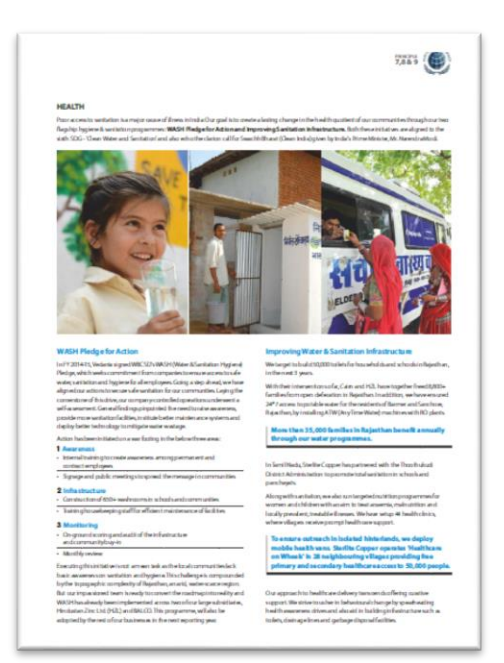
Vedanta Sustainability report

Given the interdependence of the company on the wellbeing of local communities from which it draws large parts of its workforce, the WASH Pledge is now also extended to cover local communities. More than 650 washrooms have been built in local schools and communities. The rest of the business will follow in the next reporting year. Improving water and sanitation infrastructure for the nearby communities is one of the company's focus areas. Raising awareness is often not easy, given the need to bridge the cultural gap between communities and business operations which often arises.