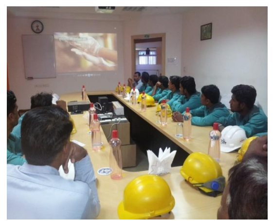
WASH awareness training

Next steps include the provisioning of waterless urinals in office areas, hostels, etc. where there is reduced likelihood of dust exposure, and the scope of options for environmentally friendly disposal of sanitation waste / pads generated from female toilets.