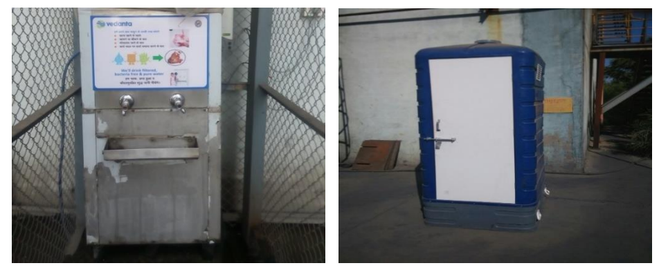
Examples of water points and mobile toilets installed in response to WASH Pledge self-assessment

The action plan to address gaps related mostly to setting up systems and review mechanisms, meaning that little capex investment was required. In some Vedanta companies, infrastructure was upgraded or improved. For example, in Bharat Aluminium Company (BALCO)<sup>6</sup> operations, 71 toilets (including in local communities) and water purifiers along with water coolers were installed in the sites.