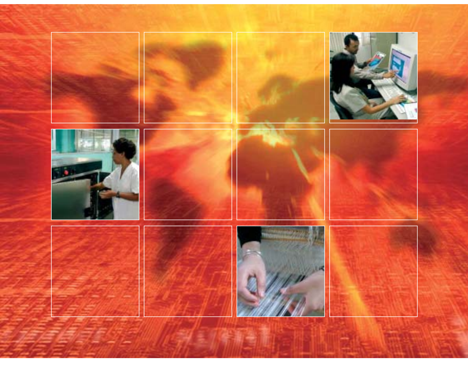
Ten Business Cases