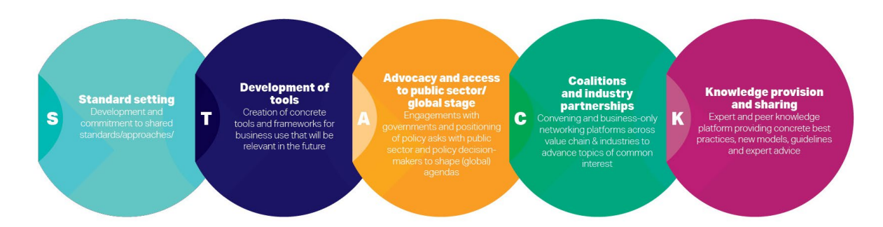
Figure 3: WBCSD Value Impact Framework